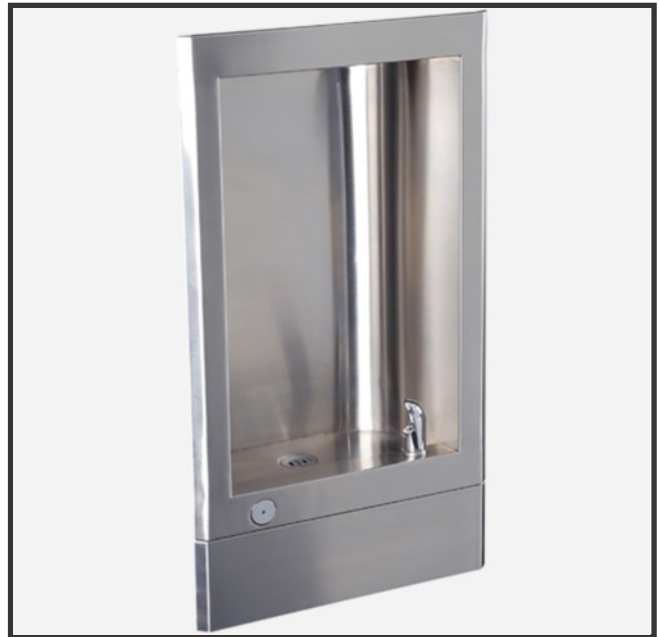
“INDOOR USE ONLY”